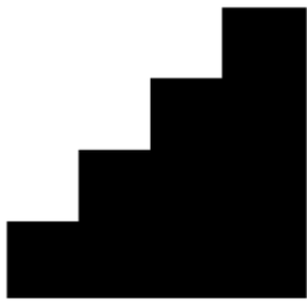
Skills, Training & Professional Development

The Skills, Training and Professional Development Working Group will help both decision makers and freelancers understand that employees' career development is very important.