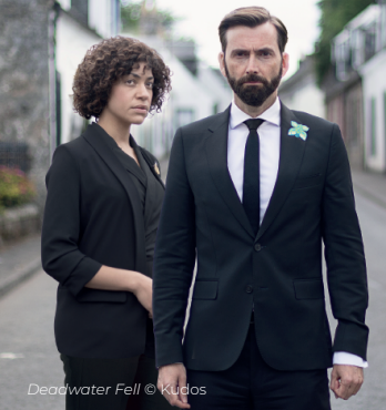
Deadwater Fell