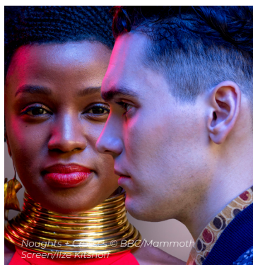
Noughts + Crosses