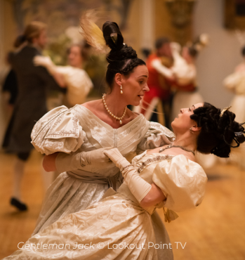
Gentleman Jack

“It can only help to have backing from such a well-established and trusted training provider and I am so happy to be part of the Leaders of Tomorrow programme, which I believe will help me achieve my goals in the industry.”