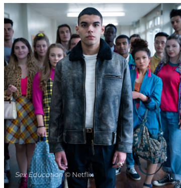
Sex Education

“I am incredibly proud to support the ScreenSkills High-end TV Skills Fund and its remit to provide the best possible opportunities to develop an inclusive and highly skilled workforce.”