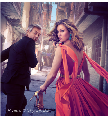
Riviera