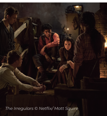
The Irregulars