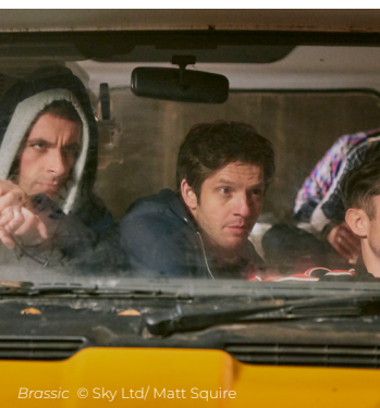
Brassic