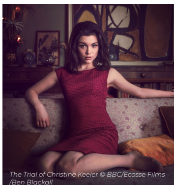
The Trial of Christine Keeler