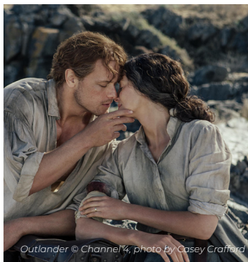
Outlander © Channel 4, photo by Casey Crawford