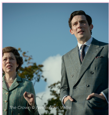
The Crown

“ScreenSkills have been amazing. They were able to make all these step-ups happen, including on the series Deep State through the Make a Move course, where I moved from trainee to assistant. I think getting these credits on my CV would have been much more difficult or perhaps would have happened much further down the line.”