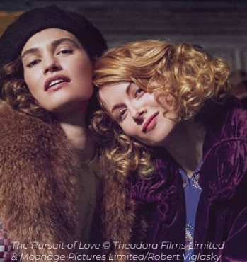
The Pursuit of Love

“I am determined to build on the momentum we have created whether it is to tackle skill gaps, provide pathways for transferrers, support crew to move forward or provide entry level training.”