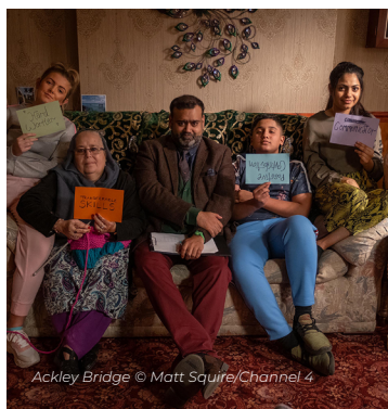
Ackley Bridge

- Poppy Moorcroft, costume designer and Make a Move participant