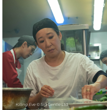
Killing Eve