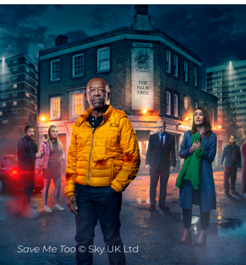
Save Me Too

“The ScreenSkills HETV Skills Fund is working hand-in-hand with the industry to tackle skill shortages and ensure that the pipeline of talent is both diverse and inclusive. I couldn't be more supportive of the fund and the opportunities it provides.”