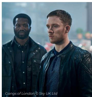
Gangs of London