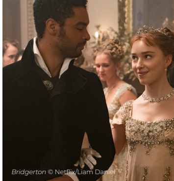
Bridgerton