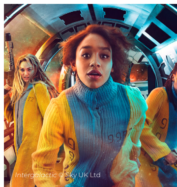
Intergalactic