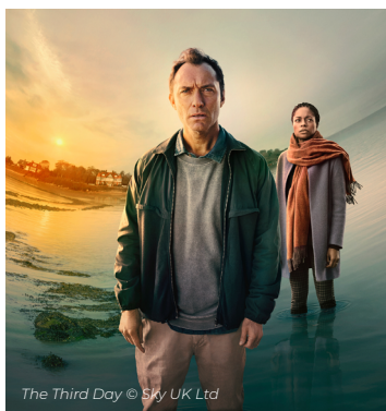
The Third Day