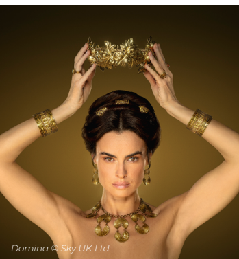
Domina